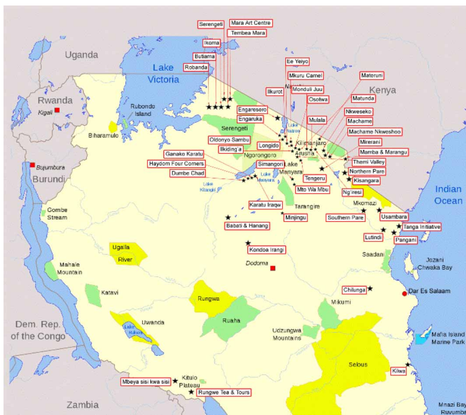
Figure 2: Map of Tanzania showing the location of CTPs