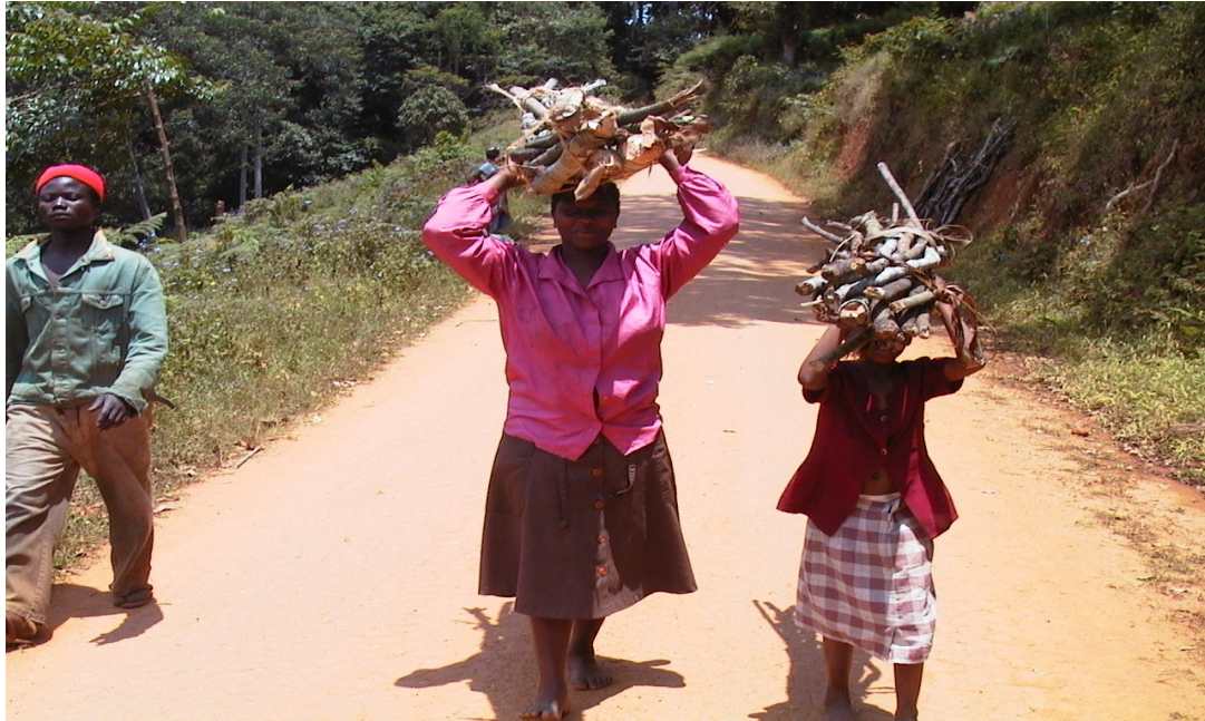
Plate 6: Firewood collection in ANR