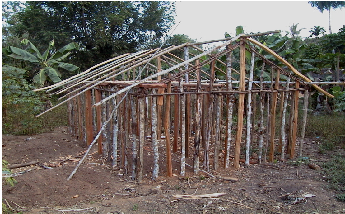
Plate 2: A local house under construction using threatened tree species around ANR. Note that poles are Allanblackia stuhlmannii while roofing materials are Cephalosphaera usambarensis

Observation of the houses in the study area revealed that most of the door and window frames and shutters in the upland areas were made from B.kweo indicating that it is highly extracted from the Nature Reserve. A. stuhlmannii is mainly used as building poles (Plate 2), withies, roofing material and sometimes frames. The sapwood of the tree is actually removed, the heart wood, which is resistant to decay, is used.