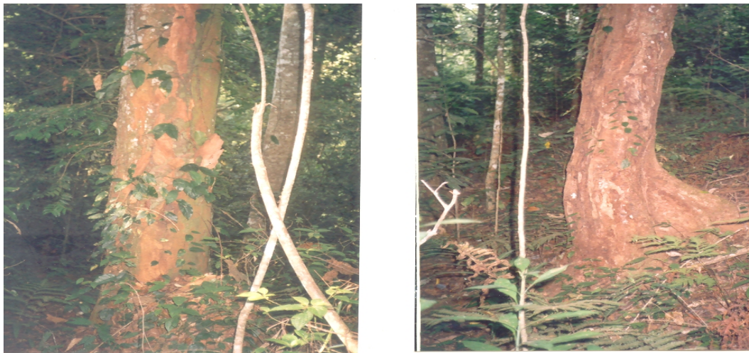
Plate 11: Dead Beilschmiedia kweo trees in ANR

Mountains due to poor competition for the resources especially light, high seed predation and availability of seedling enemies. Mugasha (1978) reported on reduction of Allanblackia stuhlmannii seed in the East Usambara hence affecting its population. He further pointed out that the low regeneration of A. stuhlmannii in the East Usmbara forests has been attributed to the sporadic and prolonged germination period which exposes the seed or seedlings to detrimental conditions. The low regeneration of these species, high mortality and high utilization pressure, suggest a high population drop hence a high risk of extinction from the wild.