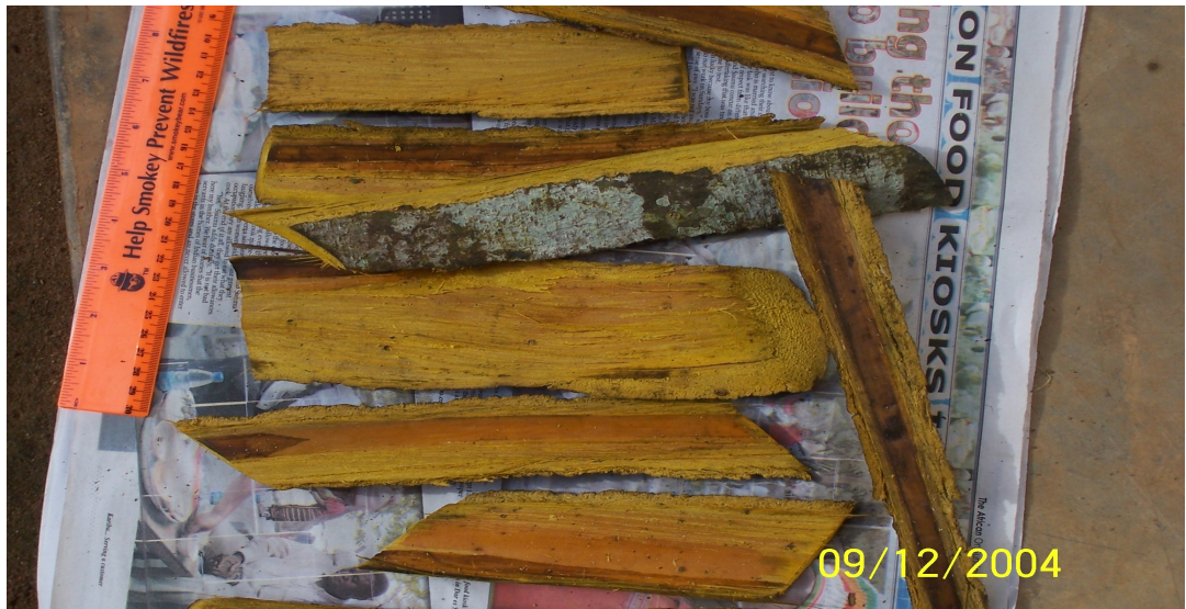
Plate 3: Annickia kummeriae barks extracted for dye and medicine production in ANR

types of tool handles made were hoe and axe handles. Large scale harvesting of this species was observed in the ANR during the inventory work.