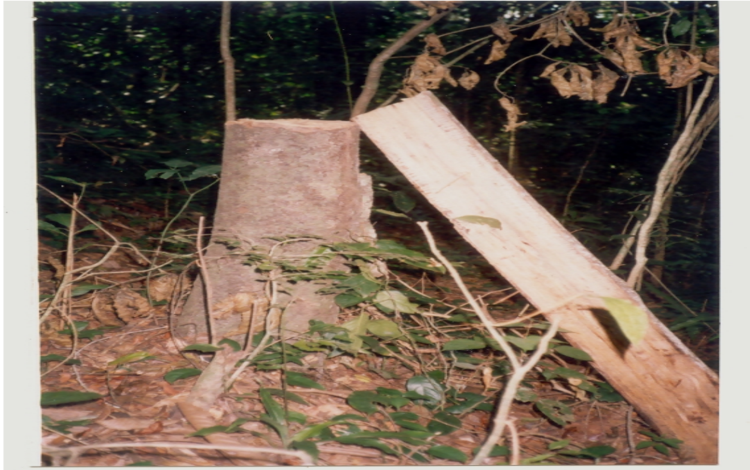
Plate 4: Uvariodendron usambarense tree species cut for tool handles making in ANR

Kisiwani village had the least users for both species, each with respondent of 1%, which could be explained by availability of alternative plantation tree species mainly Cedrella odorata , Tectona grandis , Melia adzedarach and Grevillea robusta .