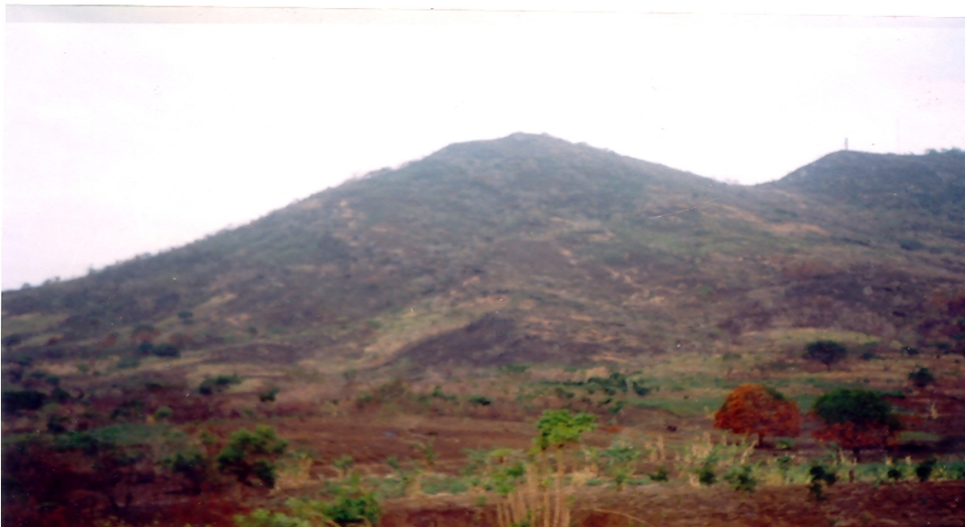
Plate 9: Forest part destroyed by fire in Mnyuzi scarp, ANR

ANR was reported to be farming activities outside the reserve. Some farmers use fire for clearing bushes as one of indigenous farm preparation mechanisms. Once the fire is out of control it enters and spreads in the nature reserve. Monela et al. (1995) argued that the fires originating from farm preparations frequently spread into some parts of natural forest and cause ecological devastation.