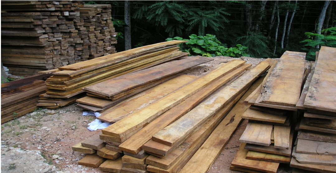
Plate 1: Beilschmiedia kweo lumber harvested illegally from ANR

Harvesting in the EAMs forests usually selects a few species of timber value such as Milicia excelsa , Newtonia buchananii , Beilschmiedia kweo , Ocotea usambarensis , Podocarpus spp. and Cephalosphaera usambarensis . If this selective harvesting is not done carefully it might erode the gene pool of these species. For example large trees of Cephalosphaera usambarensis (which is endemic to the Usambaras and Ngurus) are almost extinct. Other species susceptible to gene pool erosion are Allanblackia stuhlmanii , Beilschmedia kweo , and Juniperus excelsa . Such impacts may be a hindrance to future plant breeding and regeneration programs using indigenous species (Bjøndalein, 1992).