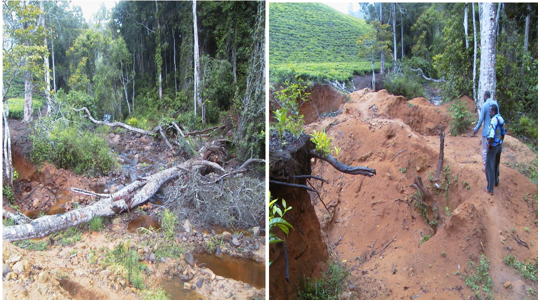
Plate 5: (left) Gold mining in water stream and (right) uprooted trees to give room for mining areas in ANR

Amani Nature Reserve management reported more than 50 mining pits in the reserve where hundreds of trees were uprooted. Furthermore the management reported 124 court cases related to illegal mining in 2005 and 2006. A total of 50% of ANR management staff interviewed reported mining activities to be the main threat to the forest. This is a serious problem when one takes into account that most gold mining in the ANR is conducted in water sources, which secure the water supply for more than 200,000 people in Tanga city as well as local communities adjacent to these reserves (Frontier Tanzania, 2001). Some of permanent streams for example Kihara, a Zigi river branch completely dried up due to mining activities. Kessy (1998) reported on gemstones such as green tomaline, red garnet, blue sapphire, almandine, armload and yellow tomaline on the northern parts of the East Usambara Mountains. He cautioned