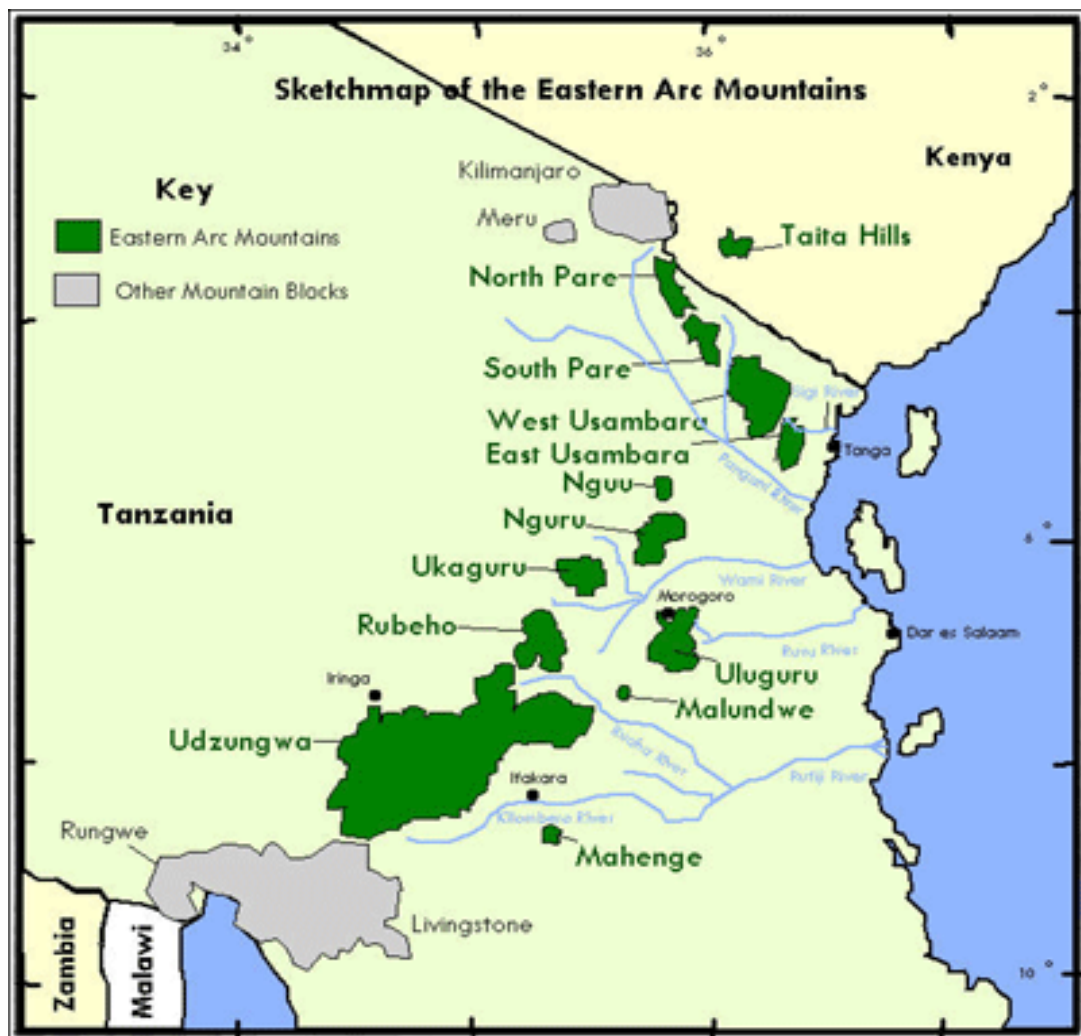
Figure 1: Remaining blocks of forest habitat in the Eastern Arc Mountains

885 ha of forest and 212 300 ha of woodlands were lost in the EAMs between 1970s and 2000 across all blocks, which is equivalent to a loss of 6% and 43% of forest and woodlands, respectively.