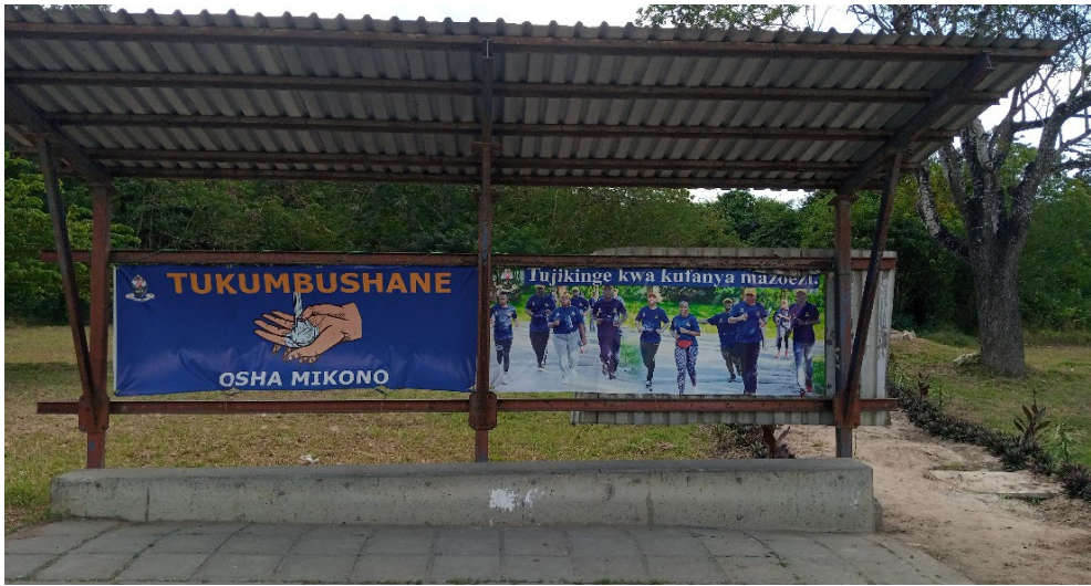
Figure 3: COVID-19 signpost at a Daladala bus stop on the Mlimani Campus of the University of Dar es Salaam. Photo: authors (July 2021)

Other public places where COVID-19 information could be obtained in universities of Tanzania include main entrances and areas allocated for cafeteria services. Figure 4 contains two foot-operated handwashing machines. The inscriptions are worn out to the left, perhaps because of the weather conditions. Based on this image, this service must have been placed during the first waves of COVID-19 in Tanzania, which occurred in March 2020 (Bashizi et al. 2021; Mumbu, Hugo 2020).