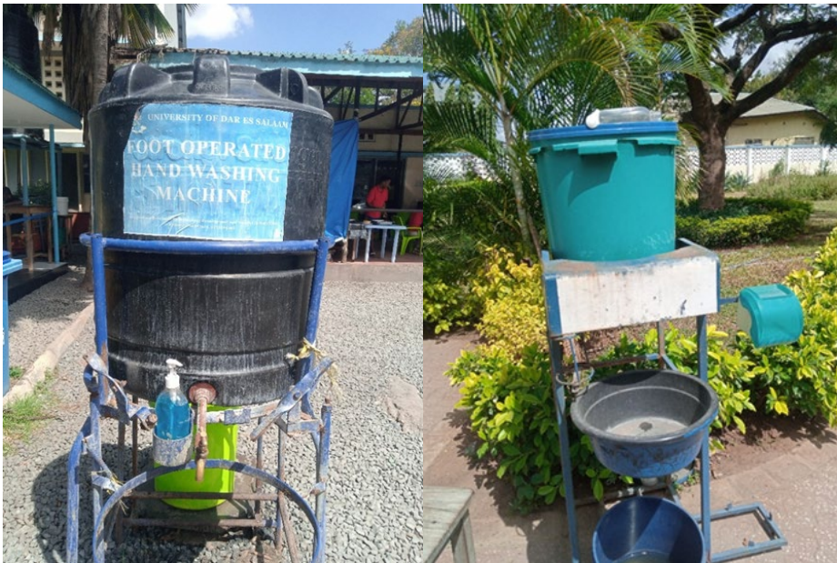
Figure 4: Handwashing machines at Muhimbili University of Health and Allied Sciences.