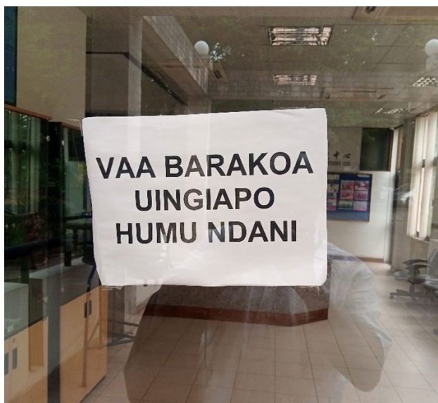
Figure 8: A notice at the main entrance to the University of Dar es Salaam School of Business. Photo: authors (June 2021)

In the literature, the choice of words appears to express anxiety, sadness, positive emotion etc. (Mohlman, Basch 2021; Basch et al. 2021). For example, in the text of Figure 8, the message contains the verb „VAA BARAKOA“ [wear face-mask], which is instructing the entrants to put on face-masks. Another instruction is about „UINGIAPO HUMU NDANI“ [when entering inside], which indicates that wearing a face mask is mandatory.