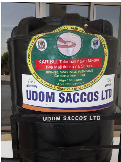
Figure 5: English-Kiswahili notice at the University of Dodoma. Photo: authors (June 2021)

KINGA, KITENGO CHA ELIMU YA AFYA KWA UMMA“ [Department of Prevention, the Section of Public Health Education]. The choice of Kiswahili aims to target the public, which speaks more Kiswahili than English (Puja 2003; Lusekelo, Mdukula 2021).