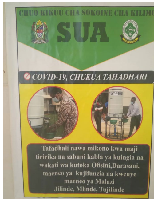
Figure 2: Signpost at the main entrance to Sokoine University of Agriculture. Photo: authors (July 2021)

worldwide, where lockdown has been the norm, and online teaching was adopted (Radić et al. 2021). Nonetheless, numerous banners, public notices and signposts containing COVID-19 related information were placed in strategic public spaces on campuses.