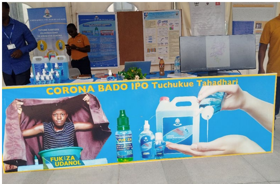
Figure 6: The banner for the COVID-19 medicine manufactured at the University of Dar es Salaam. Photo: authors (May 2021)

Put in the words of HUEBNER (2006), the images reinforce the message provided about the COVID-19 pandemic.