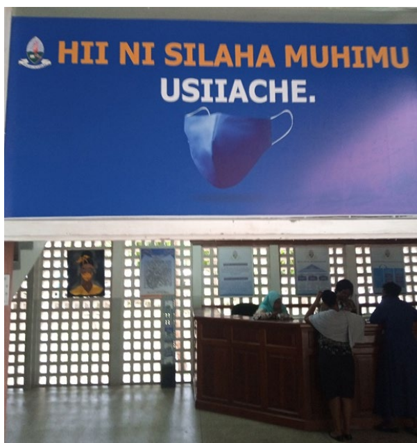
Figure 1: Signpost at the entrance to the Administration Block of the University of Dar es Salaam. Photo: authors (June 2021)

The Government of Tanzania issued a statement that demanded education institutions to institutionalise the COVID-19 protocols. However, based on the characterisation in Backhaus (2007) and Cenoz, Gorter (2006), the signage that emanates from such instructions is typically top-down. The nature of such signposts and the language contained therein is the core of the discussion hereunder.