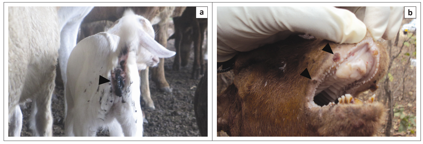
FIGURE 1: PPR-suspected animals showing (a) diarrhoea and (b) erosions on the palate and gums (see arrow heads).

Post mortem showed enlarged and congested lymph nodes associated with the gastrointestinal and/or respiratory tract, as shown in Figure 2. These findings have been reported by Roeder et al. (1999), Centre For Food Security And Public Health (CFSPH) (2008), OIE (2008) and Chauhan et al. (2009).