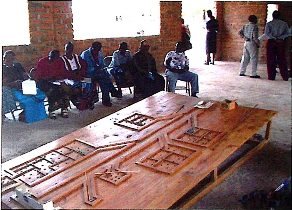
First version of RBG board, in Tanzania. Source: SWMRG. (2006)