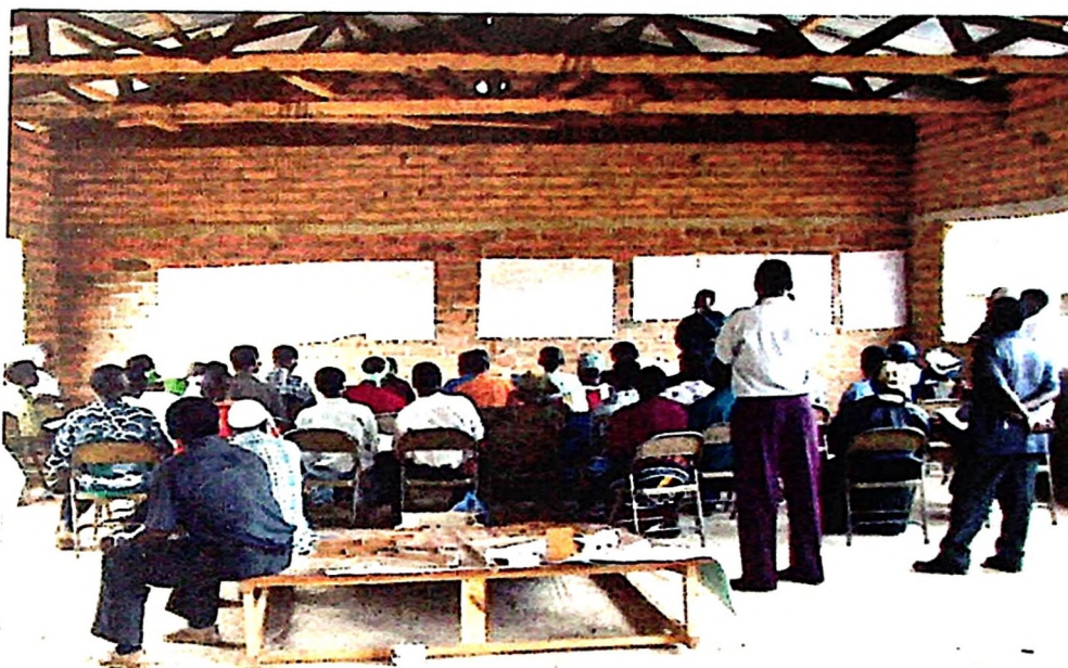
How water users in Mkoji subcatchment used the RBG to develop strategies aimed to improve equitable allocation of water.