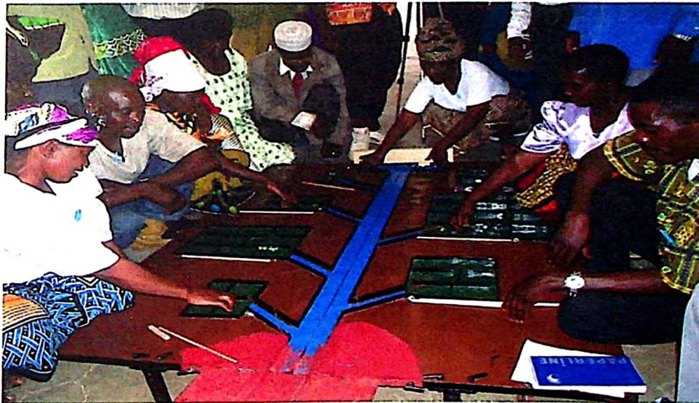
Water users using second version of RBG (role playing).