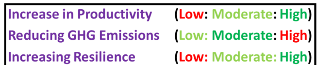
Figure 3. Real CSA Model.