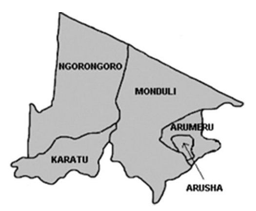
Figure 1. Map of Tanzania showing location of the study area (http://en.wikipedia. org/wiki/Arusha_Region)

In collecting data, both primary and secondary data were considered. A range of questions was prepared in order to get primary data. Semi-structured interviews and focus group discussions were used to obtain some information on the language of tourism. Questions were both close and open-ended and were answered by respondents through group interviews and very few questions were answered individually and recorded (see Appendix 1). Also guides' radio call communication was recorded with a voice recorder and transcribed (see Appendix 2).