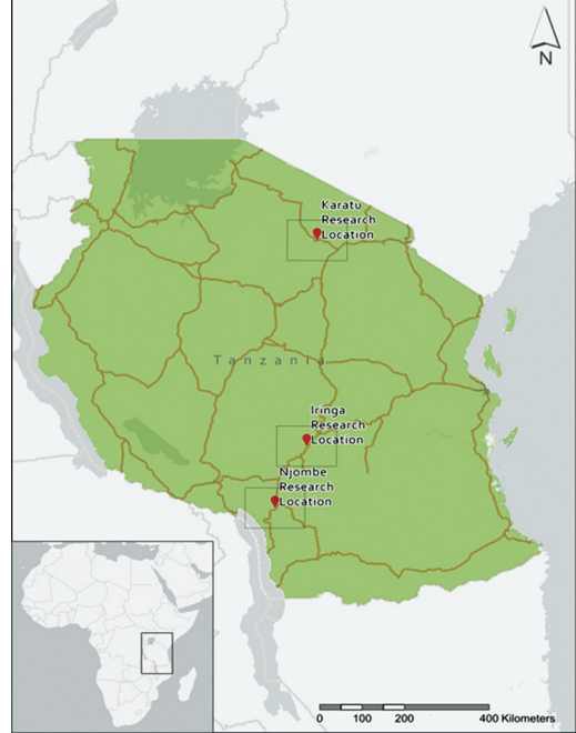
Figure 1: Map Showing Research Locations

Other commercial farms are specialized on dairy cattle's. Some of the large and medium scale commercial farms were installed with silos of varying capacities.