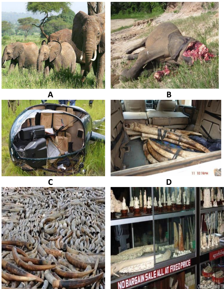
Fig. 1 A): Elephants – one of iconic and keystone species found in Tanzania, B): An elephant killed for its ivory, C): The aircraft crashed while it was tracking a group of elephant poachers near the Maswa Game Reserve, Tanzania, D): Ivory found in a car in Dar es Salaam, E): Ivory from poached elephants, F): Items made of elephant tusks displayed in a shop in China

Elephant poaching and the illicit ivory trade rank among the topmost wildlife crimes globally (5-8). The factors driving this crime include a rapid growth in the demand for ivory in Asian countries for fashion and medicinal purposes [5, 6], and unemployment, widespread poverty and corruption in the supply countries [7, 8]. The illicit ivory trade is a low risk and high profit undertaking, and is one of the main reasons making wildlife crime rank fourth after drugs, arms and human trafficking [9, 10]. The global trade of illegal wildlife is estimated to generate between US$8 billion and US$10 billion per annum [9, 10]. Because the demand for ivory has skyrocketed in recent years, its price in consumer countries has increased exponentially. For example, demand in China has tripled the price of ivory in just four years from US$750/kg in 2010 to USD$2,100/kg in 2014 [11]. High prices stimulate supply and result in increased elephant poaching in the origin countries, where economic and social problems such as poverty, population growth, unemployment, insecurity and corruption are widespread.