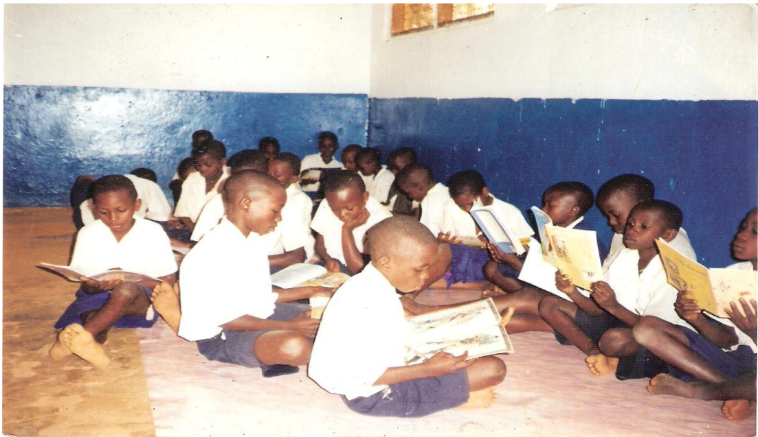
Figure 1: Poor learning environment including lack of desks in Vikumburu primary school.

Some pupils in Standard Two were writing while seated on the floor because of the shortage of desks. Only five desks were present in the classroom which was not enough to accommodate sixty pupils enrolled in the class. This situation affected the teaching and learning process hence some pupils decide to leave school. Accessibility of facilities to support services in Kisarawe as shown in Table 7 below indicate that there is big problem of teachers houses almost in each school. Lack of houses for teachers and desks for pupils contribute pupil's dropout, since the teachers and pupils lack the motivation to perform their duties.