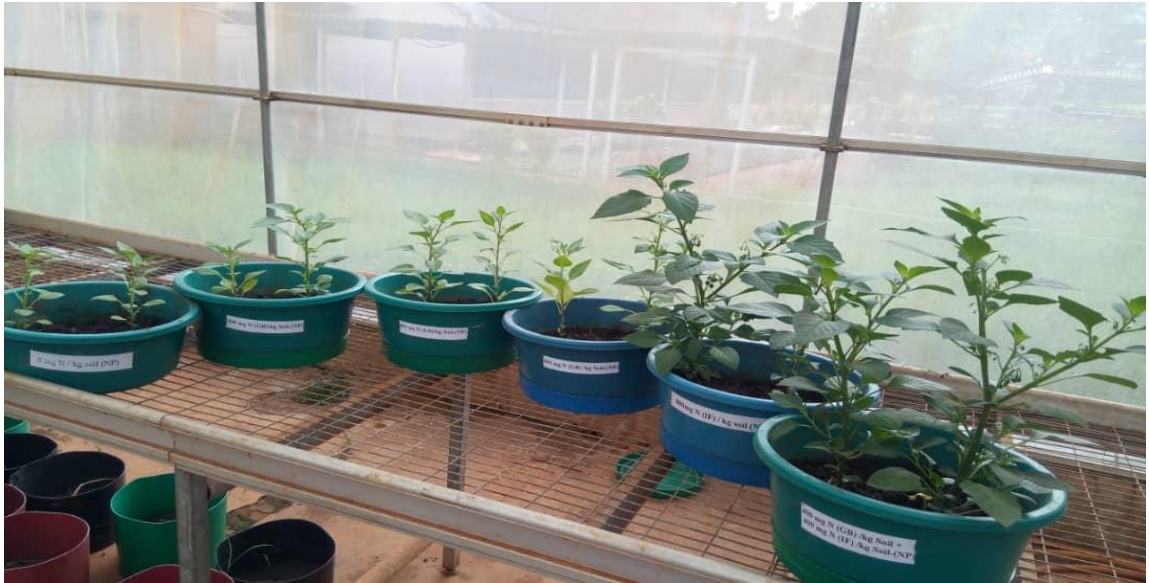
Plate 4.1: Performance of nightshade 42 DAE as affected by bio-waste compost