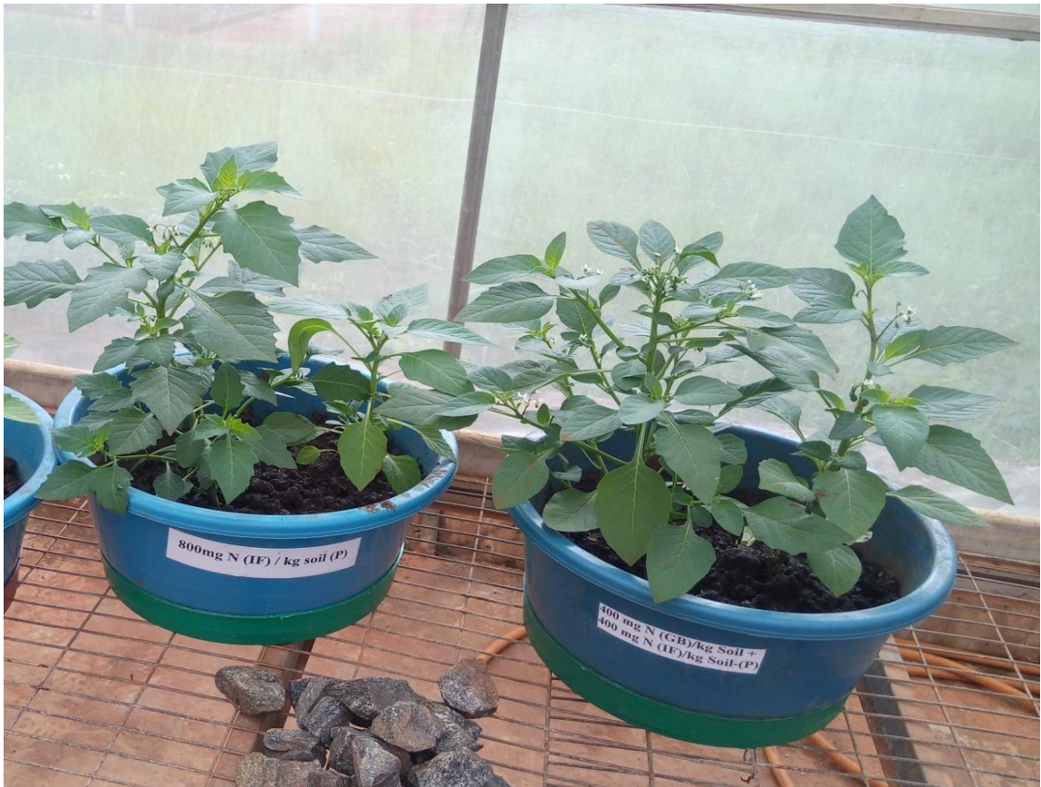
Plate 4.2: Appearance of the best performing nightshade 42 DAE and the corresponding application rate of inorganic fertilizer