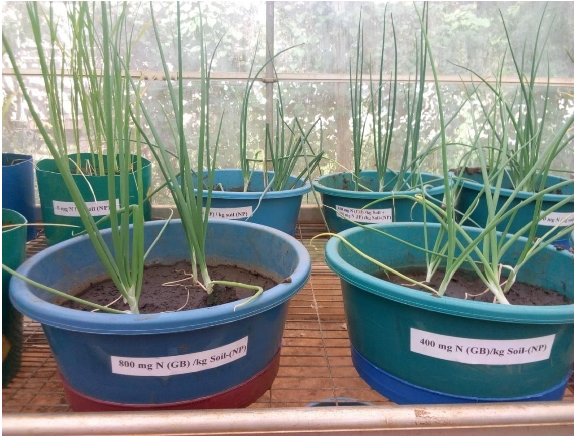
Plate 4.3: Appearance of onions 42 DAE on application of GUBC