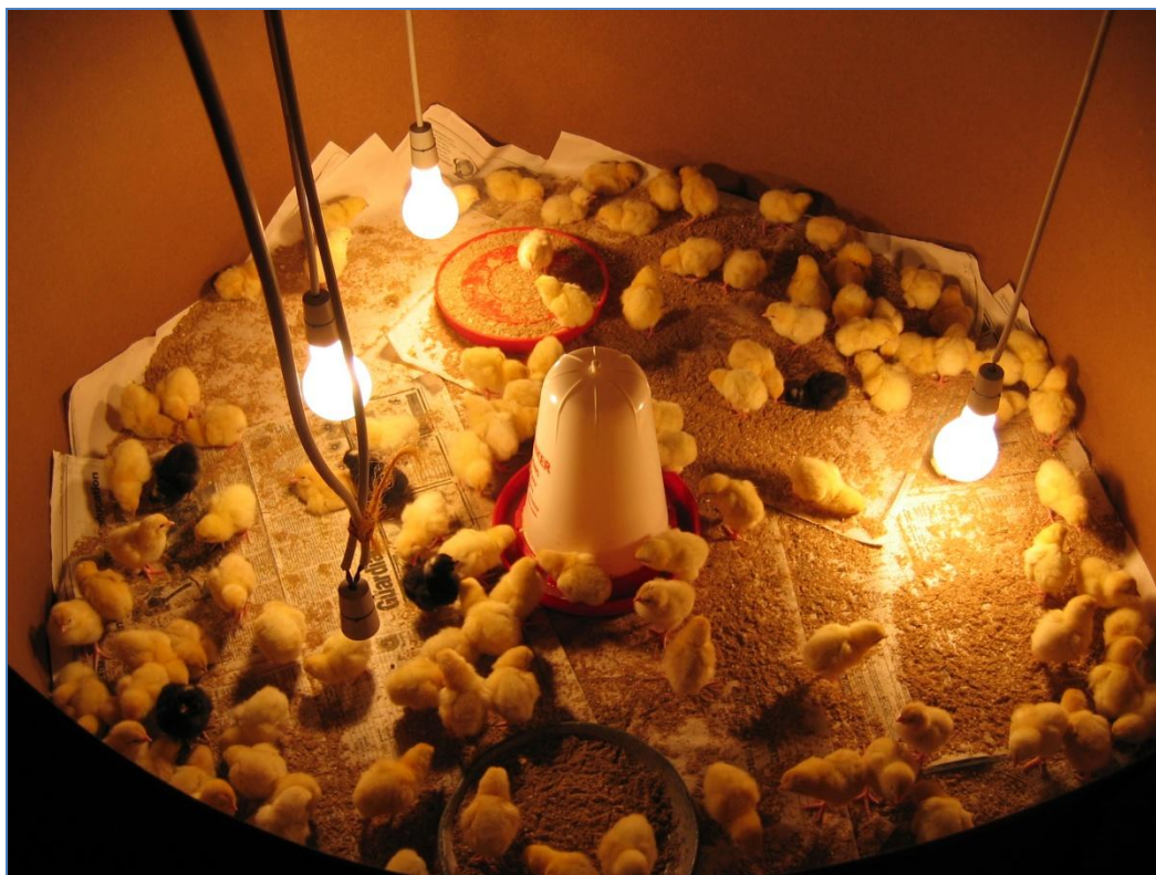
Figure 3. Brooder facility constructed of hard boards, showing cockerel chicks being provided light, heat, feed and water