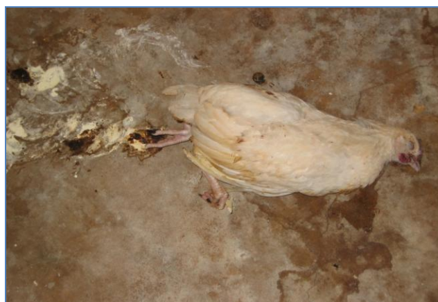
Figure 4. Dead cockerel with chalky faecal materials on the floor