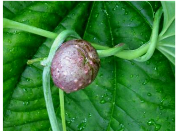
Figure 1. Dioscorea sansibarensi aerial bulbis (regarded as more poisonous)

240 cm long. Electrical system was connected and fitted with several 200 watts bulbs, to generate light and heat (Figure 3).