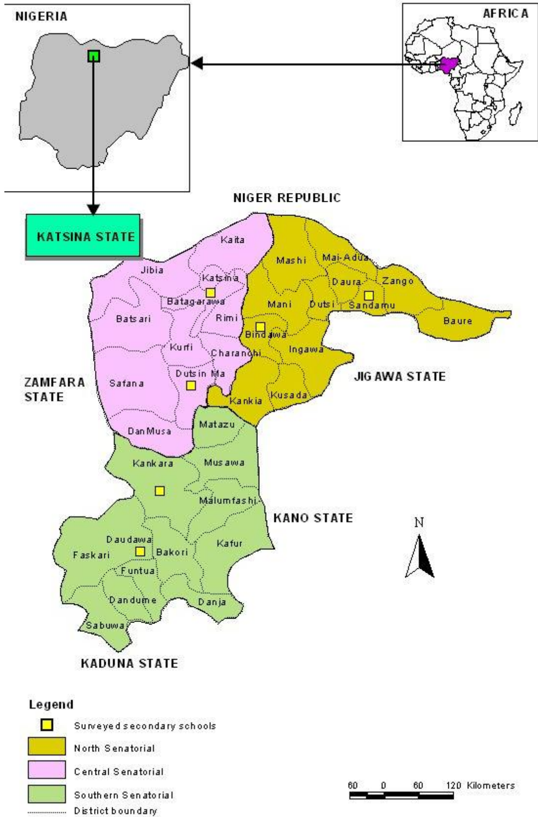
Figure 2: Map of Katsina State, Nigeria showing the study area