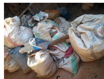
Fig 1. Common (A and B) and rare (C) methods of keeping pig manure pending their disposal or transportation to farm land as observed in Morogoro municipality, Tanzania, 2015.