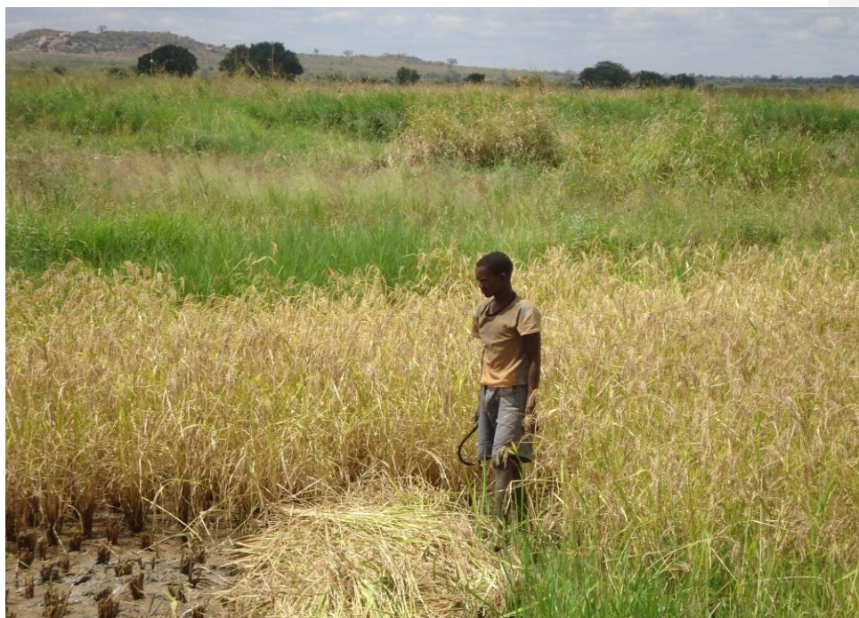
Plate 4: Paddy harvesting in Bahi village