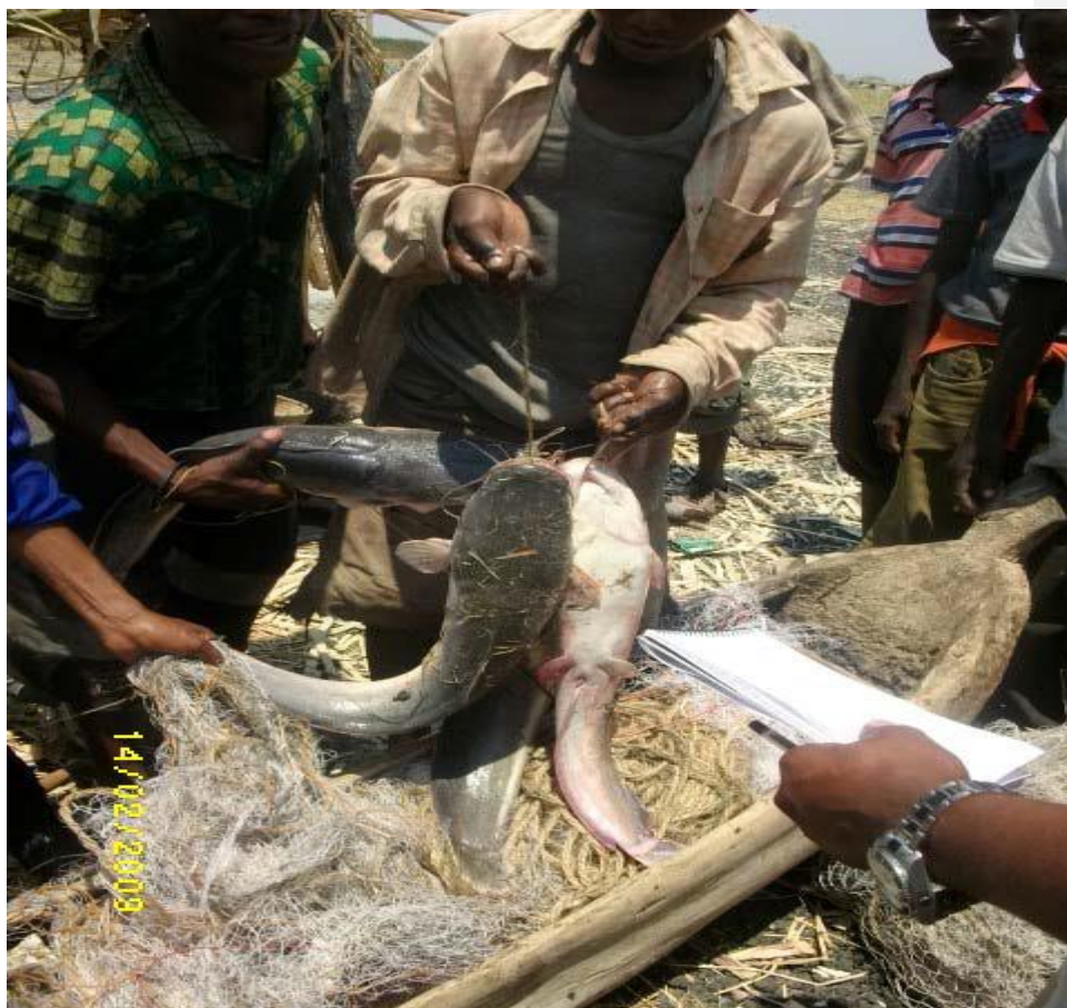
Plate 2: Fishing in Ilindi village (Cat fish).