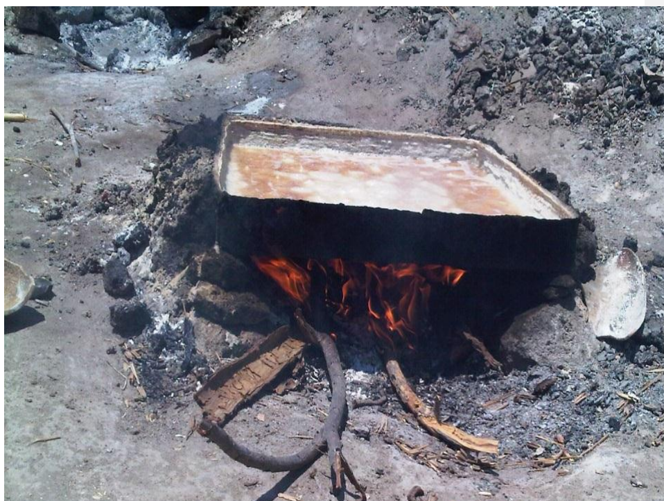
Plate 1: Traditional salt production in Ilindi village

were also collected from three randomly selected sources of water in which samples were collected in triplicate from each source. A total of six samples of salt (Plate 1) were collected from two sources in triplicate. Three samples of soda ash were collected from one source which was the only one at Ilindi village. Three flamingo birds were caught for analysis where their livers, gizzard, skin and flesh were analysed separately. Cat fish (Plate 2) were also collected from the swamp and their skin and fillet were analysed for uranium content separately.