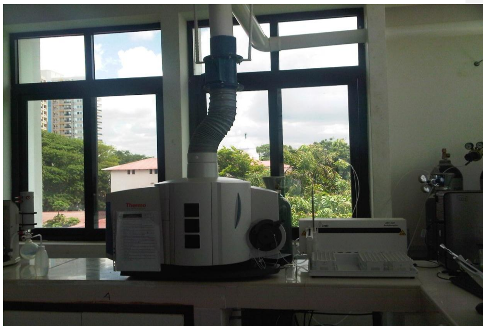
Plate 5: ICP-OES used in analysis at GCLA

This was done at The Government Chemist Laboratories Agency (GCLA) in Dar es Salaam by the use of Inductively Coupled Plasma-Optical Emission Spectrometry (ICP-OES) model iCAP 6000 series manufactured by Thermofishers in England using the method recommended by ISO 2171: 2007 (Plate 5).