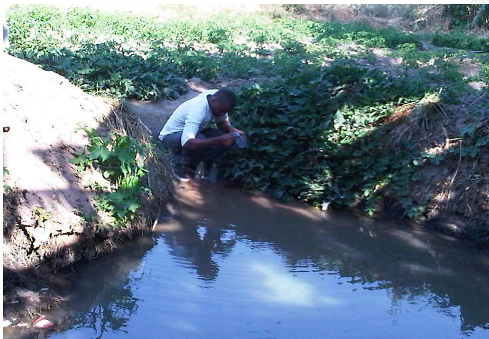
Plate 3: Water source from Mpamantwa village

From Bahi village; a total of 15 samples of rice were collected from five randomly selected paddy fields (Plate 4) in which three samples were drawn from every field at random. A total of nine samples of water were also collected from three randomly selected sources at Bahi village from three sources in triplicate.