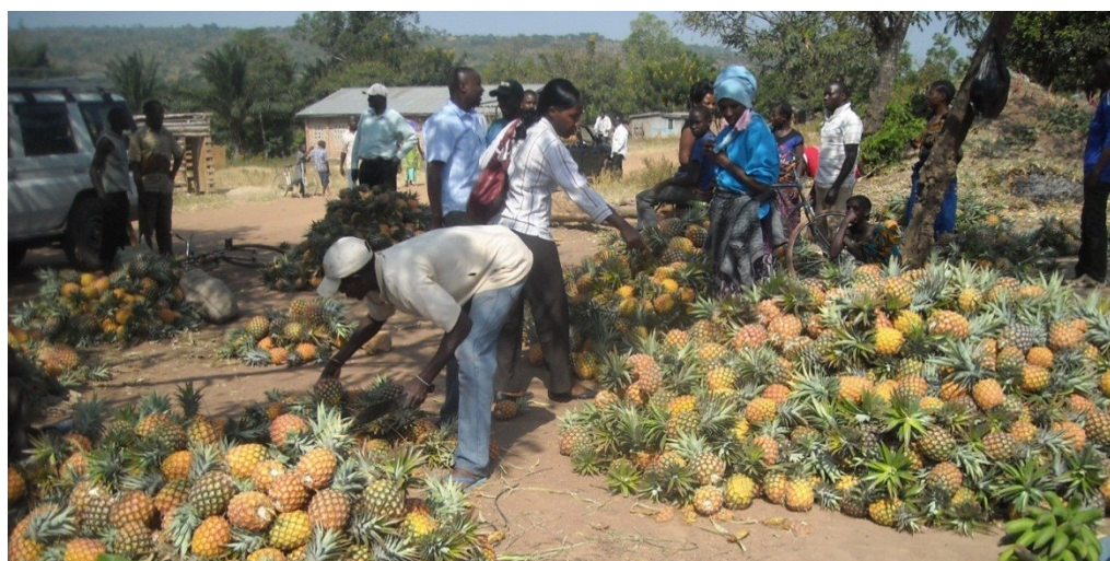
Plate 3: Market place at Igate village

sell pineapples in such regions as Mwanza, Kagera, Shinyanga, and Simiyu. But farmers have become more of price takers than price makers in Geita district because there are no organizations which help them to find good markets; therefore, farmers prefer to sell the fruits at the market place rather than at the farm-gate. They would sell at extremely low prices in the farm than is the case in the market; they are afraid were of paying for transport and casual labour. The farmers sell pineapples to people within the villages at the same price they sell along the roadside points in places such as Kakubilo Centre, Sungusila, Igate, Nzera and Bugurula.