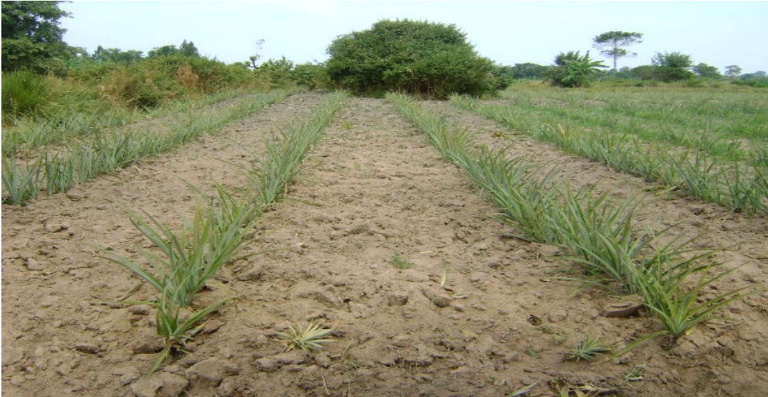
Plate 2: Mono cropping system in Nzera ward