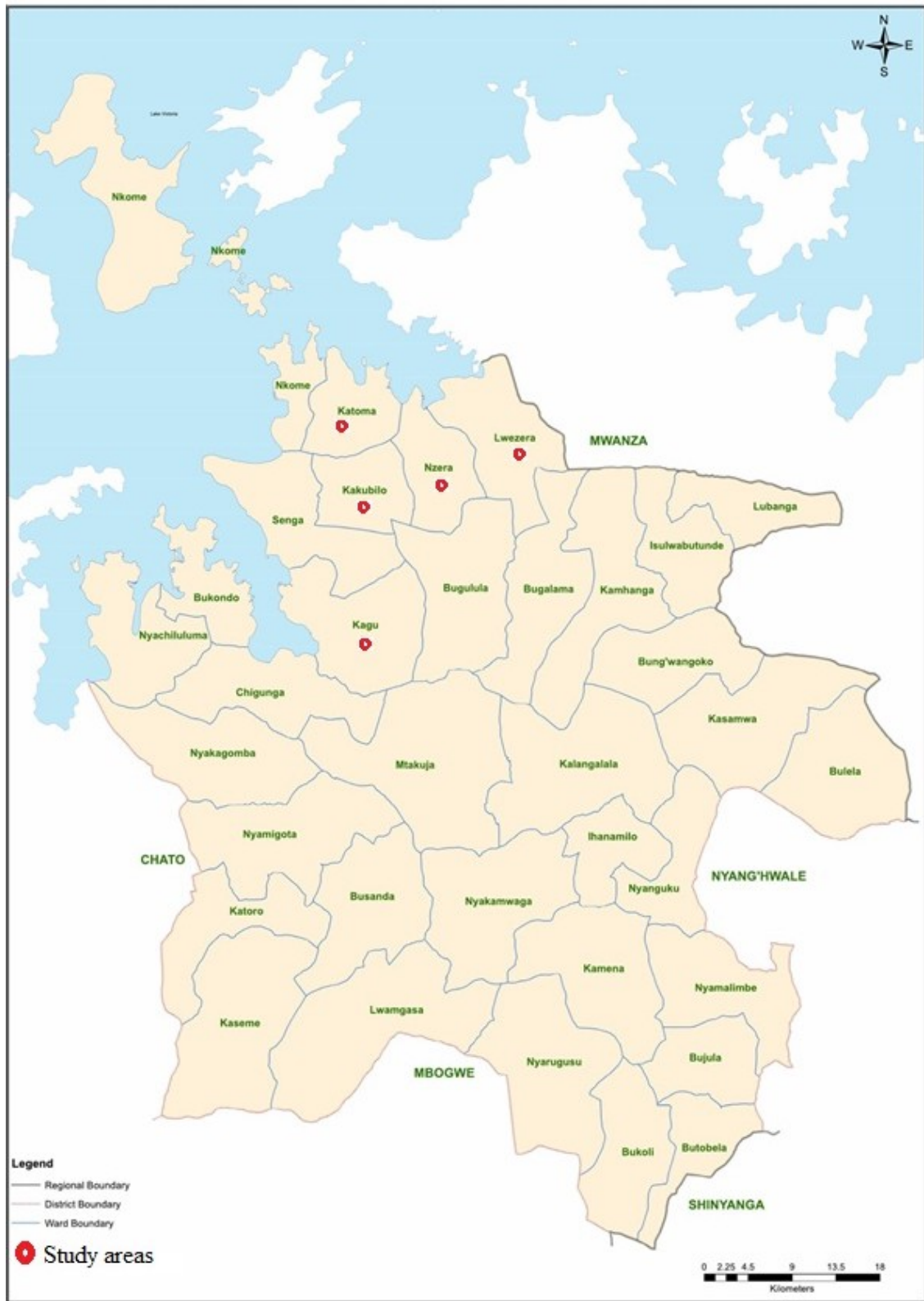
Figure 2: A map of Geita District showing study areas