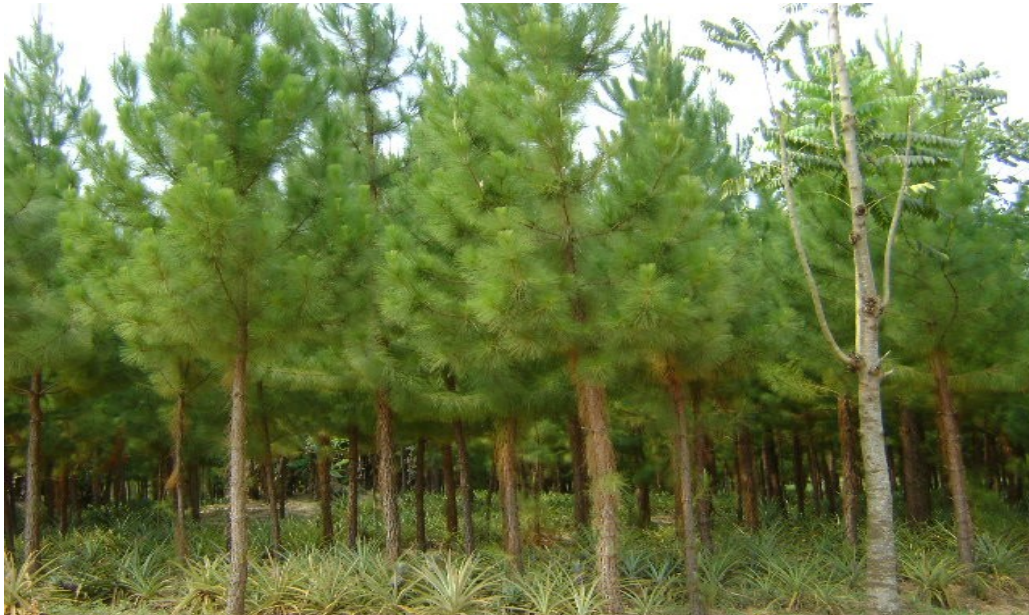
Plate 1: Pines and Pineapple in Nzera ward

cassava, maize, and beans. This finding is similar to the one reported by Onubuogu et al. (2014) who revealed that farmers adopt mixed cropping practice for many reasons which include; efficient management of land, coping with climate change, ensuring food security and food availability all year round, increasing income and reducing incidences of pests and diseases. Also the system is used as a means of maximizing productivity, diversification of crops on their small land holdings. Twenty seven point five percent (27.5%) of the respondents use intercropping with trees like pine. During FGDs and key informants it was reported that intercropping is used by farmers for ten years of growing pineapples; after that in the subsequent years farmers leave the farm for the trees and that becomes the end of the lifespan of pineapple production leaving pine trees in the fields.